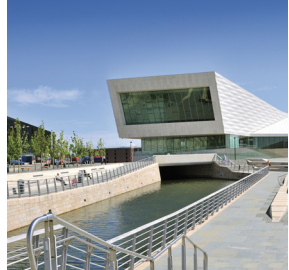
Museum of Liverpool

2.00pm Museum of Liverpool: This landmark building on Liverpool's historic waterfront was opened in 2011 and has won a number of awards. It reflects the city's global significance through its unique geography, history and culture. www.liverpoolmuseums.org.uk/mol/ 0151 207 0001