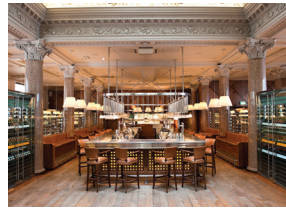
Restaurant Bar and Grill

It is now bulging with fabulous new shops, hip buzzing restaurants, hip hotels and trendy wine bars, as well as a world class cultural offering with the finest collection of museums and galleries outside London. Then of course there's the city's other major attraction, its people, who are famously warm and funny, and will welcome you with pride.