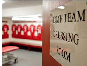
Liverpool Football Club

This city bursts with energy, life, humour, and so much to do. Enjoy your visit - we know you will.