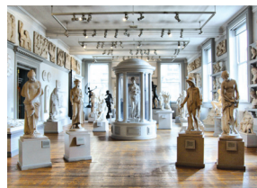
The Walker Art Gallery

Accommodation hotline: +44 (0)151 237 3895